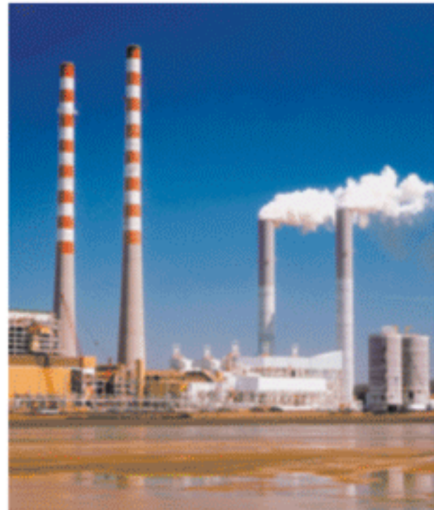
At TVA's Cumberland Station, an ALSTOM limestone Wet FGD with 6 absorber modules and 60 recycle pumps are used to bring this 2600 MW station into Clean Air Act, Phase 1 compliance.

Since putting into service the first, full-scale wet flue gas desulfurization system in the U.S. in 1968, ALSTOM has installed or is constructing wet FGD Systems on over 32,000 MW of fossil-fired power generation facilities.